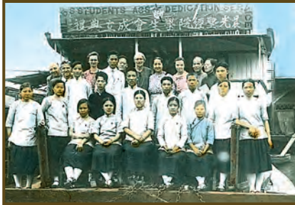
Bible School on a boat in Canton, China