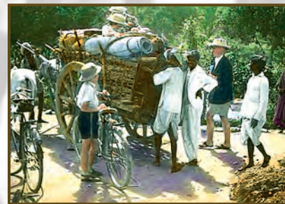
In our early years, missionaries traveled to areas of ministry by way of ox-drawn cart.